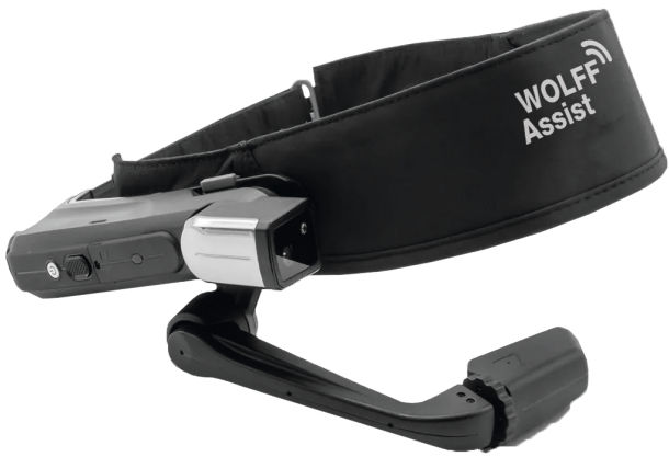
The WOLFF Assist Service Glasses

Operators or technicians can always work hands-free, which is a considerable advantage in terms of safety and flexibility. The camera transmits the technician's field of vision on the construction site to WOLFF service experts in real time.