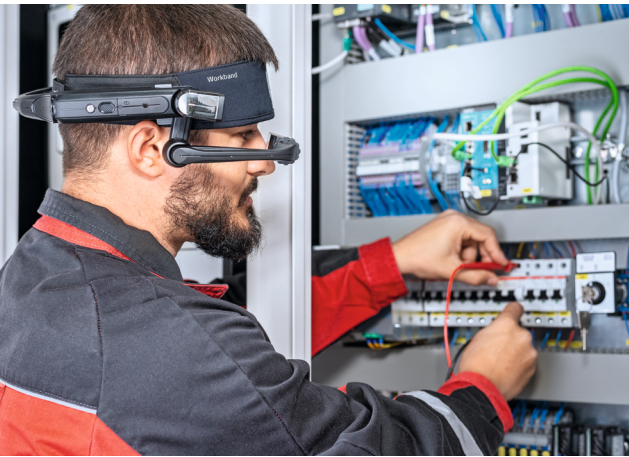
Technician on site

Get real-time live analysis and support with WOLFF Assist. You no longer need to depend on a site visit from a professional to investigate the situation. Choose to have a video call with our support team or share pictures to arrange a troubleshooting request, instead. Assistance has been made swifter and easier. Save time with prompt solutions and around-the-clock support at your request. You can now reduce the break-down time or in some cases, eliminate it by resolving the issues yourself with the help of our support team. Select the available technical engineer from our team on the WOLFF Assist display panel and seek assistance as and when needed.