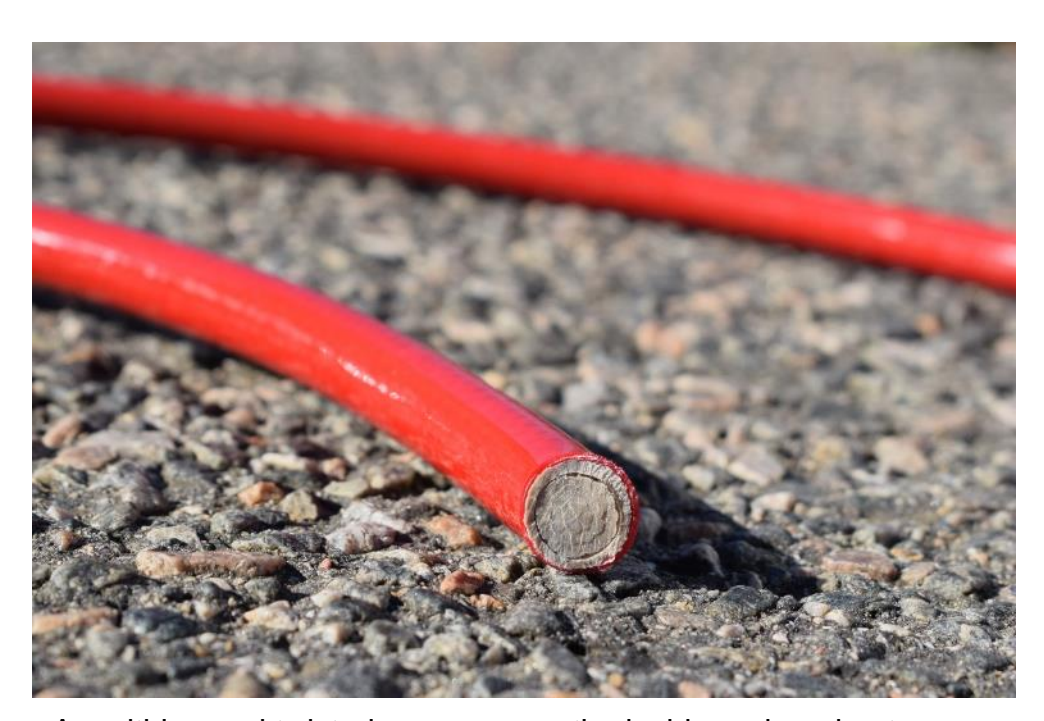
A multi-layered twisted rope core on the inside and a robust, monolithic synthetic cover on the outside: Thanks to the unique design of the chaRope® fiber rope, it is as sleek as a steel wire rope and can replace it 1:1 – with an 80% savings in weight.