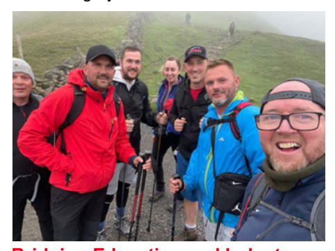
Bridging Education and Industry

testament teamwork and perseverance, our participation in the Challenge Yorkshire Peaks Three represented our commitment to physical endurance and team spirit. It resonated with our dedication to charitable causes, significantly contributing to the Children's Heart Surgery Fund.