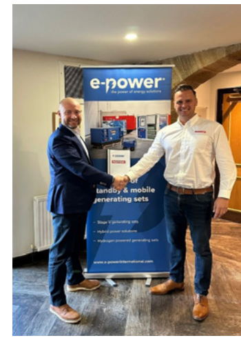
WOLFF Onsite with e-power sealing the deal for Sustainable Energy Solutions.

The WOLFF Hybrid Power Unit combines a battery pack with a stage V diesel generator, which can also be connected to the grid network or powered by solar panels. It has been strategically designed to optimise power delivery, with the battery taking on peak loads while the generator recharges it efficiently. With the benefits of a battery pack and the reliability of a conventional generator, the modular mobile unit is designed to adapt to weak grid connections and consume minimal energy, presenting substantial savings on running costs. Not only is this an economical solution, but the significant reduction in CO<sub>2</sub> meets the stage V emissions requirements, a vital objective for construction sites in the UK. This can be tricky, with other stage V generators breaking down on low load. The battery in the WOLFF Hybrid Power unit prevents this from happening, making it the ideal solution.